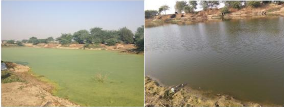
POND RESTORATION THROUGH USE OF MICRO-ALGAE